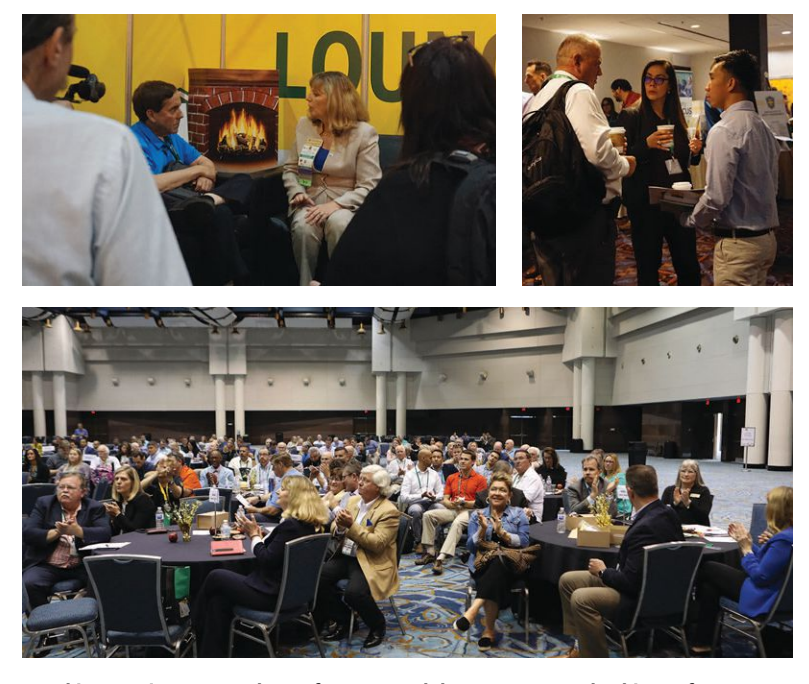
By taking part in events such as Safety 2019 and the 2019 ASSP Leadership Conference, members experience a vital community of OSH professionals that helps them grow professionally through education and networking.